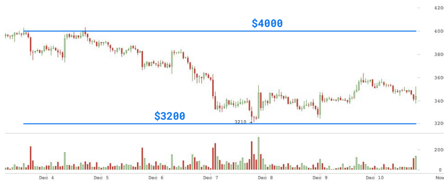
1H chart - BitStamp BTC/USD via bitcoinwisdom.com

The Bitcoin price has been under severe pressure, making new yearly lows around the $3200 mark. Intermittent upward movements are appearing but not being sustained. This time last year the BTC price was encroaching $15,000.